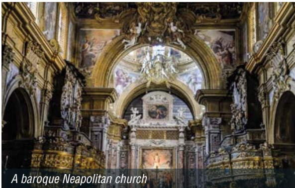
A baroque Neapolitan church