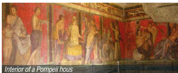
Interior of a Pompeii house