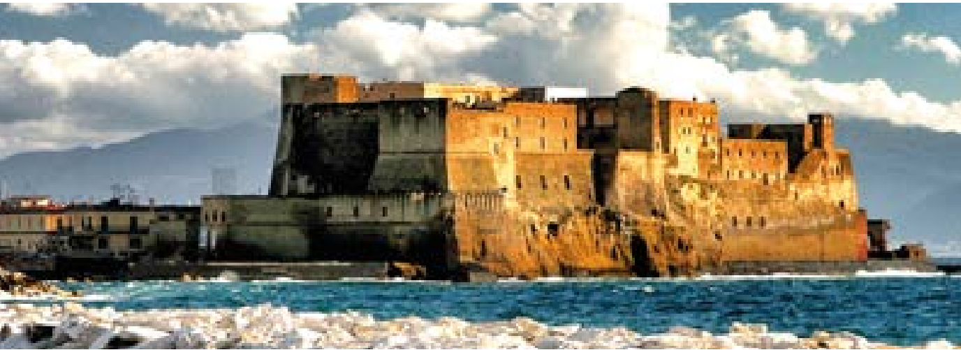
"Castel dell'Ovo" is located just in front of the conference venue