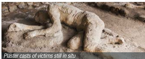
Plaster casts of victims still in situ