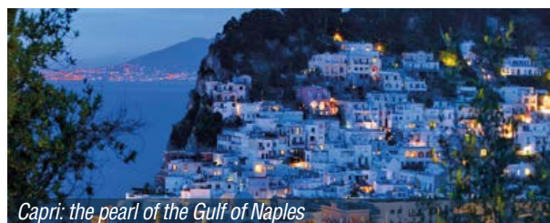
Capri: the pearl of the Gulf of Naples