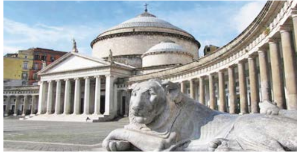
"Piazza del Plebiscito", one of the biggest squares in Napoli at a walking distance

The event will be held in the Conference Center of the University of Napoli Federico II, located in the center of a large pedestrian seafront promenade, close to Castel dell'Ovo and a few minutes away from Piazza del Plebiscito.