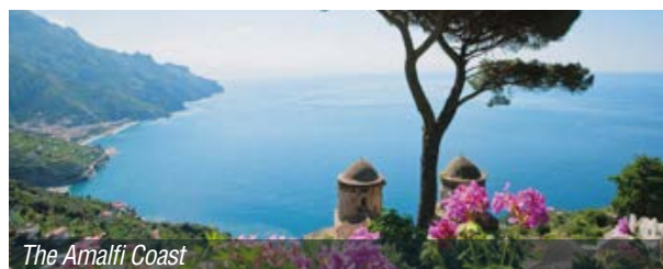
The Amalfi Coast