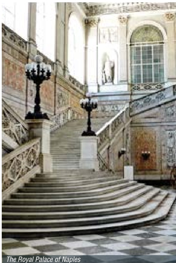
The Royal Palace of Naples