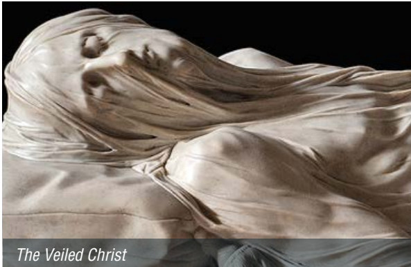
The Veiled Christ