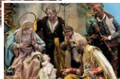
Statues of the Neapolitan crib